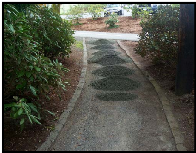
Refreshing the gravel pathways with new gravel