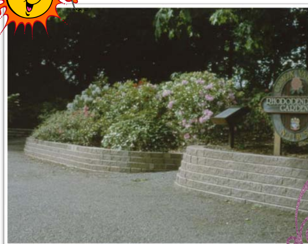
This picture taken 9 years ago, when the garden was 10 years old.