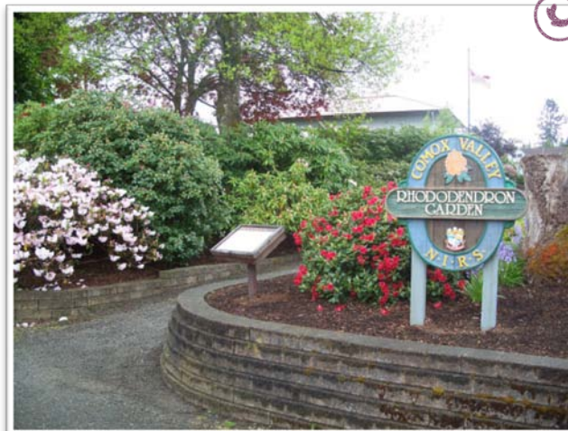
This picture taken 1 year ago, when the garden was 18 years old.